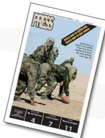
CLICK HERE FOR LAST TEN COVERS!